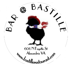
Table times may be limited. Please ask for the manager if you have any questions about our policies during Happy Hour

*State food code requires us to inform you that consuming raw or uncooked meats and seafood may increase your risk of food borne illness. Please notify us of any allergies. Some items may contain dairy, nuts, seeds, gluten. 11/18/2022