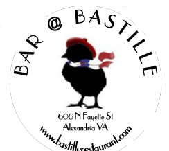
Table times may be limited. Please ask for the manager if you have any questions about our policies during Happy Hour

ENJOY OUR HAND PICKED SELECTION OF COCKTAILS | WINES | BEERS AT HAPPY HOUR PRICES AVAILABLE AT THE BAR OR IN THE CAFÉ UNTIL 8:30PM