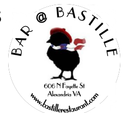
Table times may be limited. Please ask for the manager if you have any questions about our policies during Happy Hour

*State food code requires us to inform you that consuming raw or uncooked meats and seafood may increase your risk of food borne illness. Please notify us of any allergies. Some items may contain dairy, nuts, seeds, gluten, etc. 05|18|2023